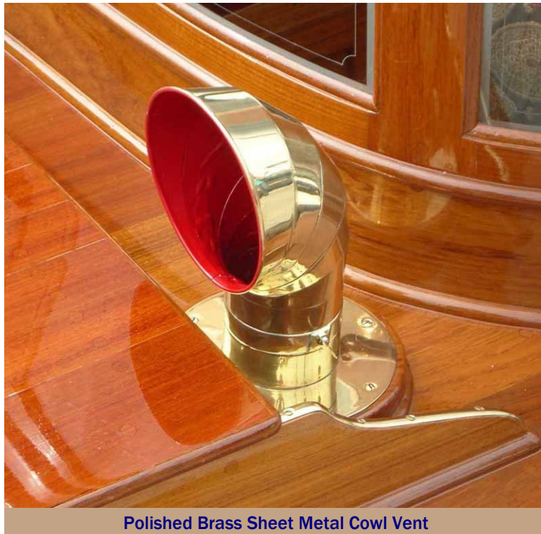
Polished Brass Sheet Metal Cowl Vent

115 Red is a good alloy for casting many marine fittings.