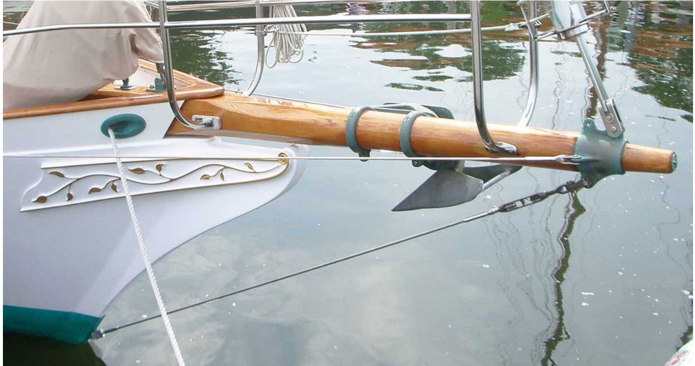
Bronze Kranz Iron, Anchor Roller, and Hawse Holes, with Stainless Steel Stanchions and Rod Rigging