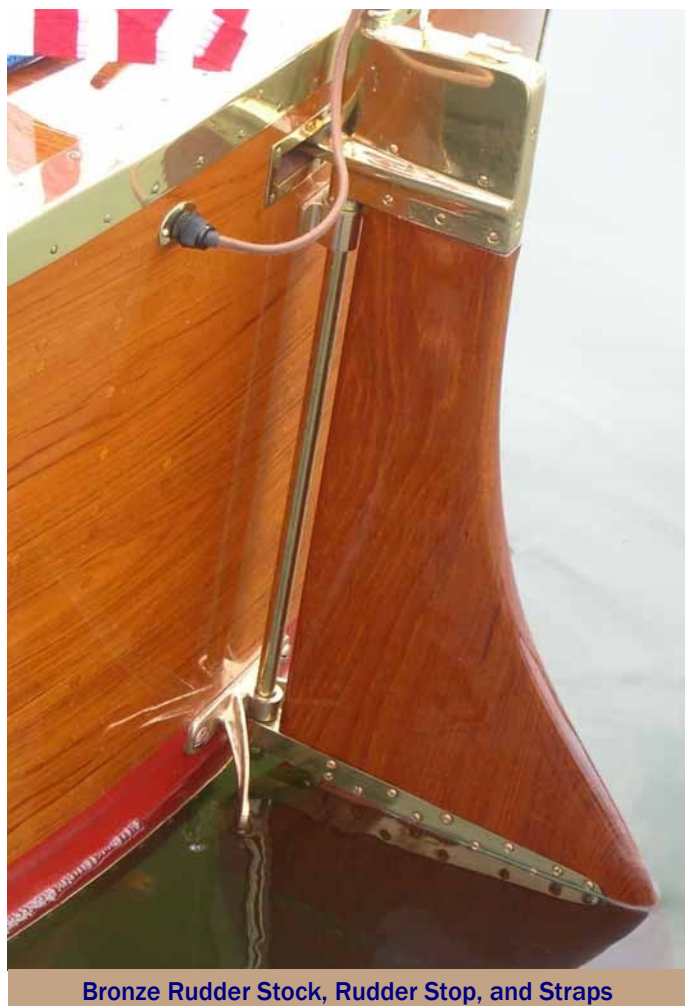
Bronze Rudder Stock, Rudder Stop, and Straps

The real king of all marine metals is Monel. It's drawback is higher cost, but whether it's fuel or water tanks, keel bolts, fasteners, or custom hardware, no other metal provides the combination of high strength and corrosion resistance that Monel offers. Monel is nickel and copper alloyed with other elements. Monel 400 is 63% nickel, 28% to 34% copper, 2.5% iron max., 2% manganese max., 0.024% sulfur max.,